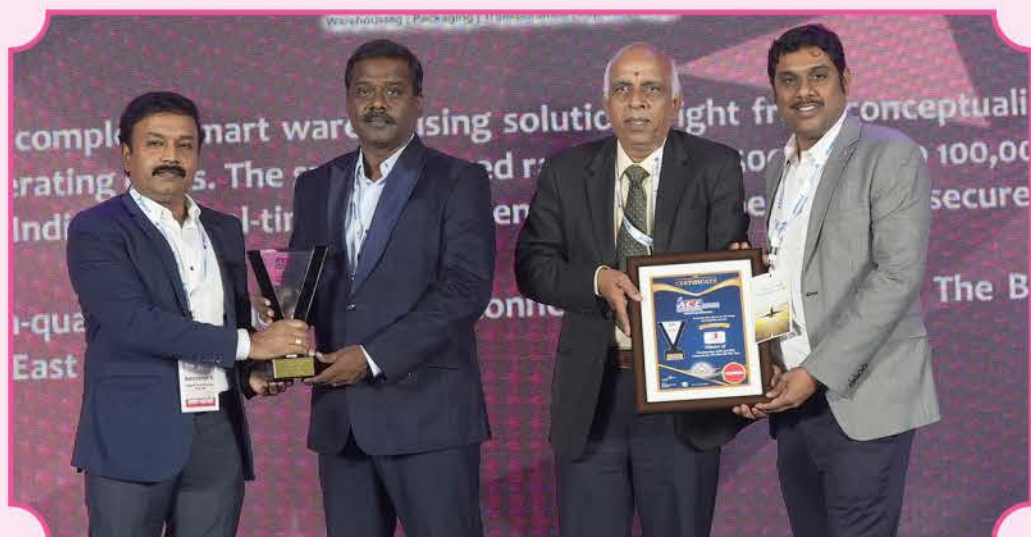
The BVM Group