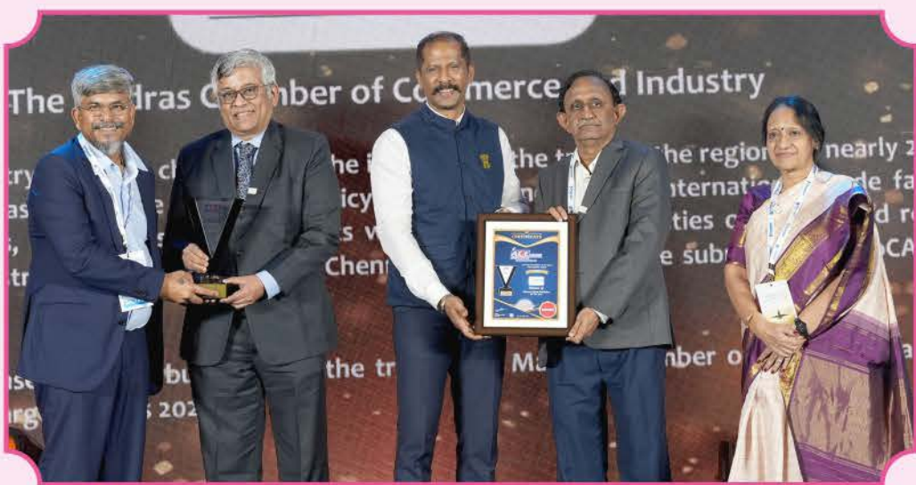
The Madras Chamber of Commerce and Industry