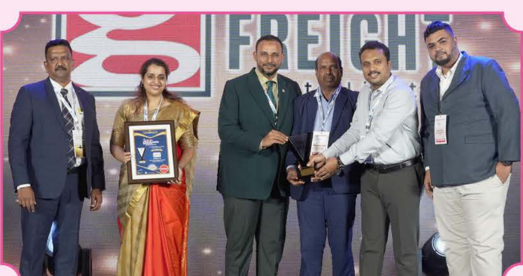
Galaxy Freight Private Limited (IN LSP SEGMENT)