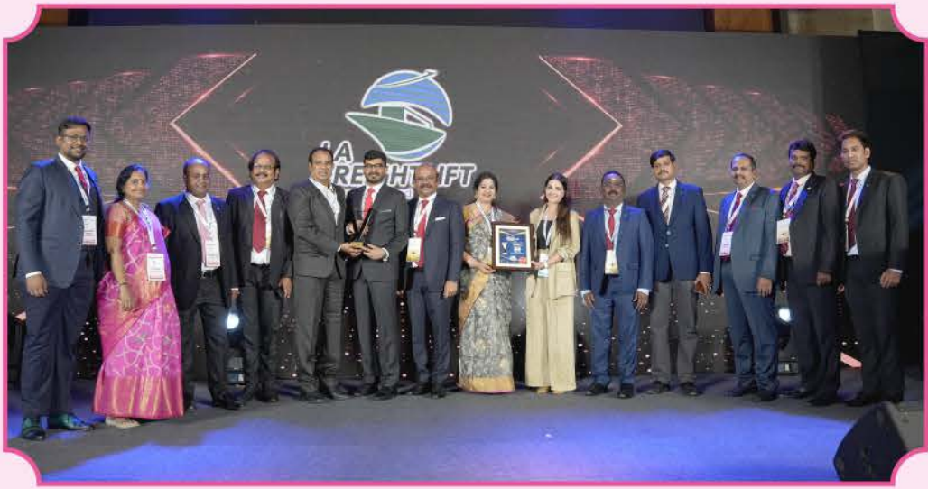
La Freightlift Pvt. Ltd.