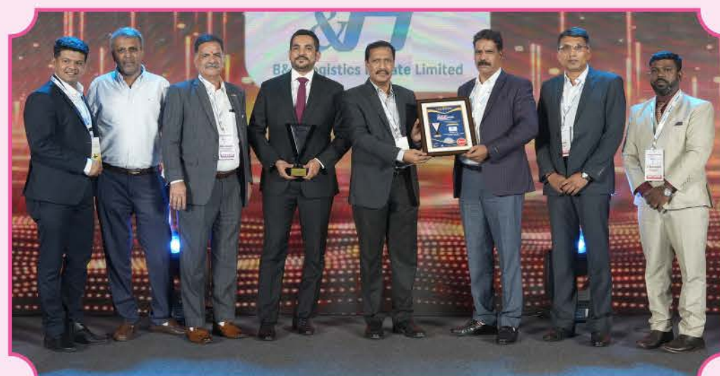
B&H Logistics Private Limited (IN IMPORT SEGMENT)