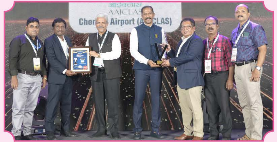
Chennai Airport (AAICLAS)