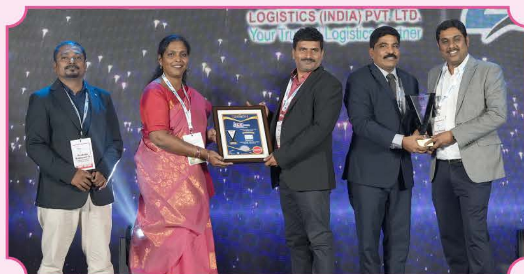
Cargomen Logistics (India) Pvt. Ltd. (IN IMPORT SEGMENT)