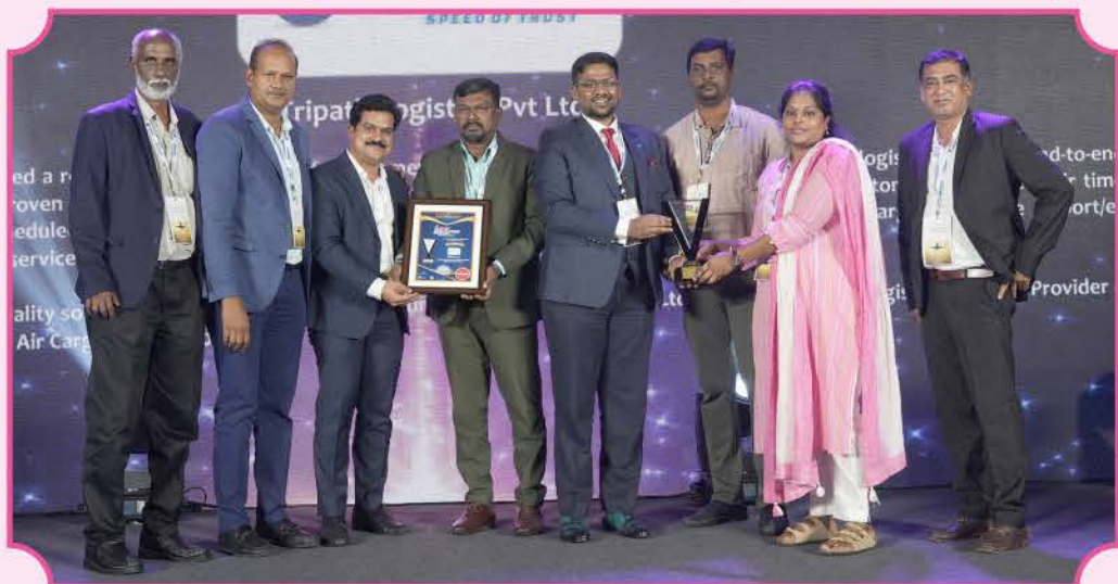
Tripath Logistics Pvt Ltd