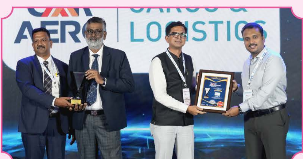
GMR Hyderabad Air Cargo (IN TERMINAL SEGMENT)