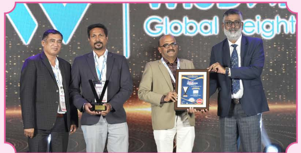
Wisdom Global Freight Solutions Pvt. Ltd.