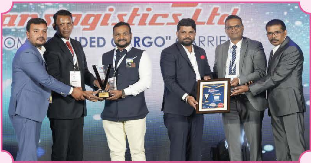
Shreeji Translogistics Ltd