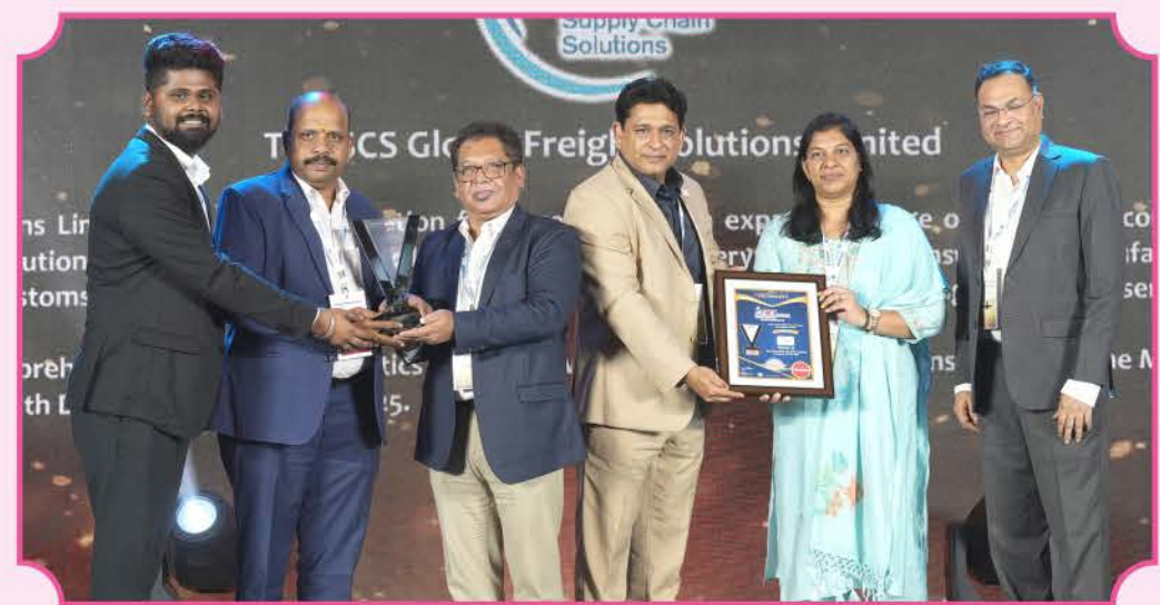
TVS SCS Global Freight Solutions Limited