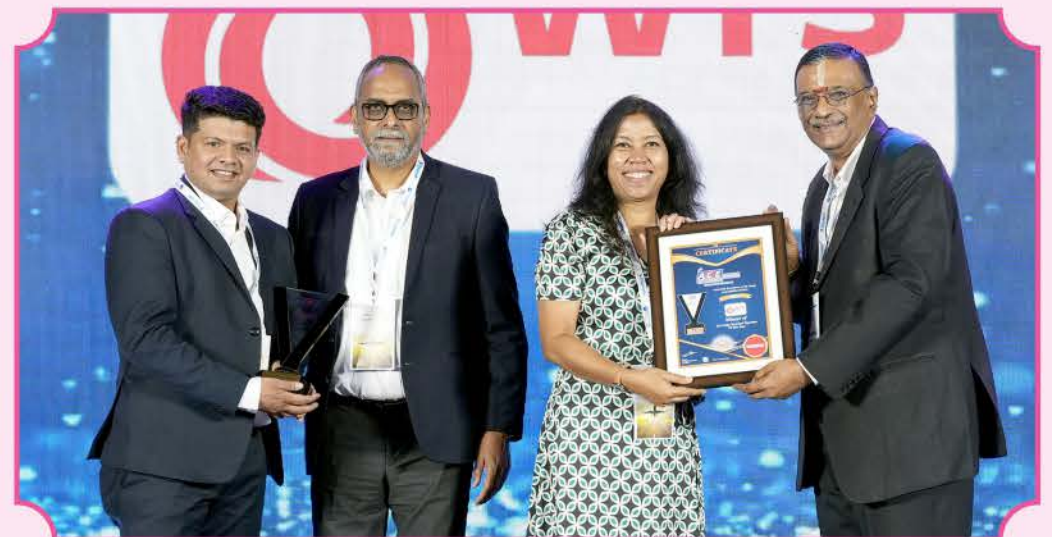
WFS (Bengaluru) Private Limited (BASED ON GROWTH)