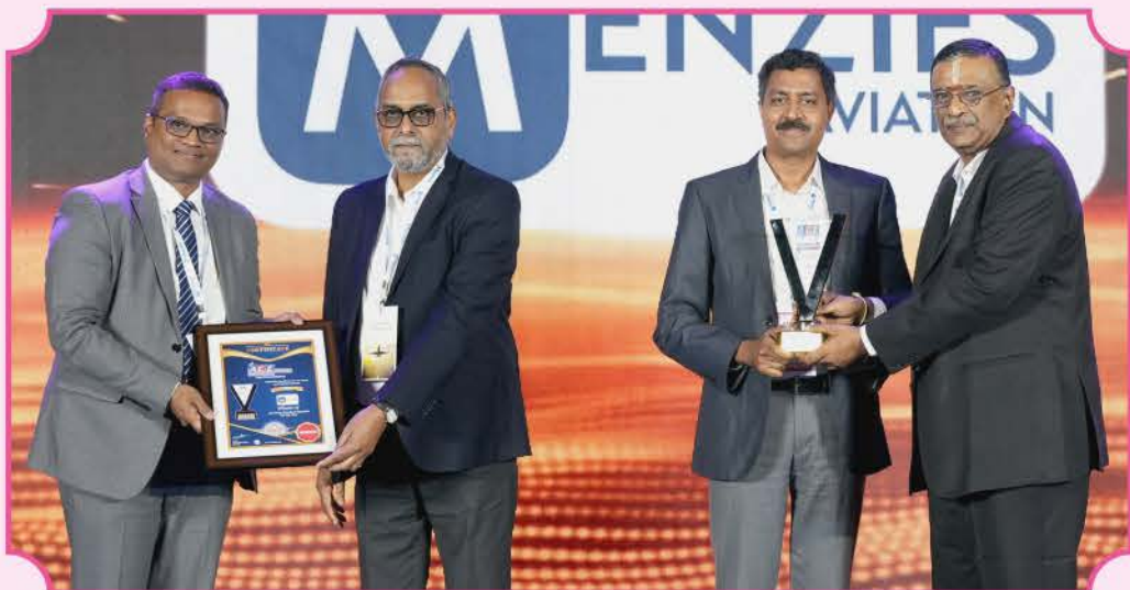
Menzies Aviation (Bengaluru) Private Limited (BASED ON VOLUME)