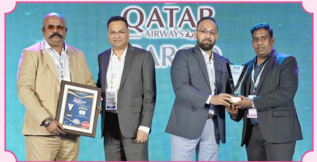
Qatar Airways Cargo