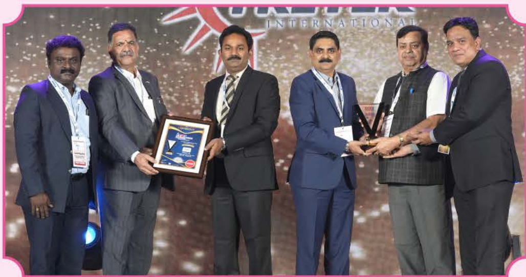
Freyer International Logistics Pvt Ltd