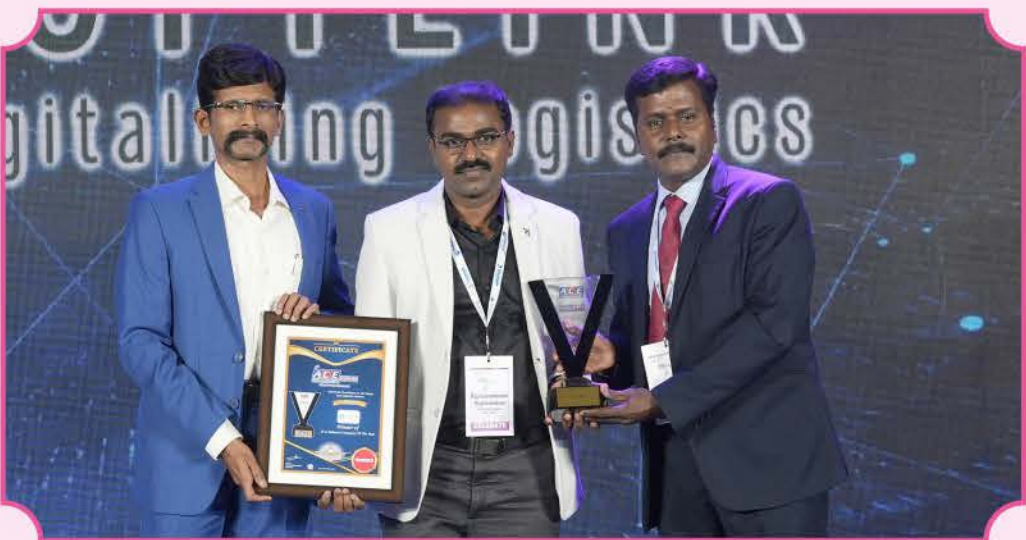
Softlink Global Pvt. Ltd.