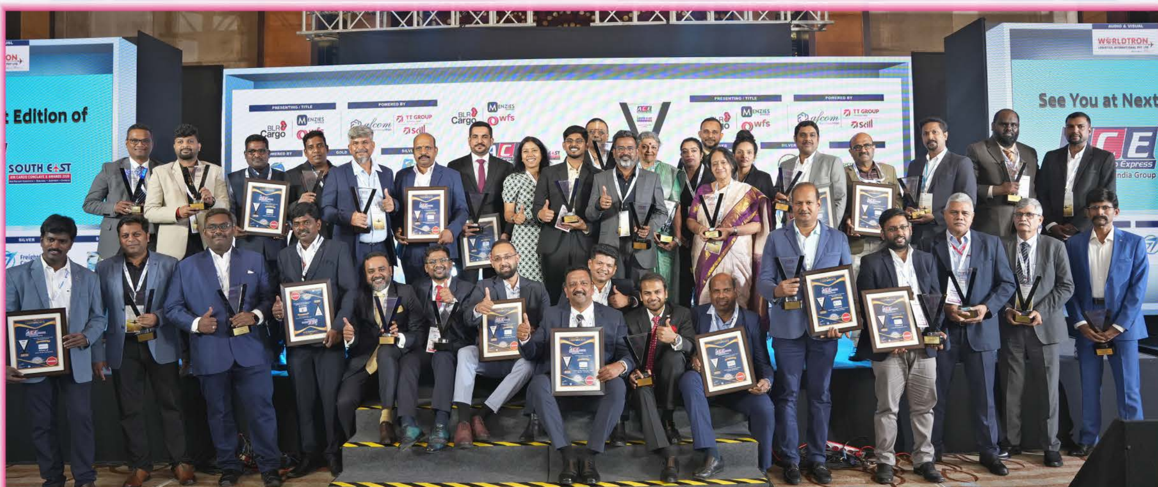
Some of the award winners

A summation of the opinions expressed by each speaker and panelist at the Conclave follows, along with the complete Awards photo-feature.