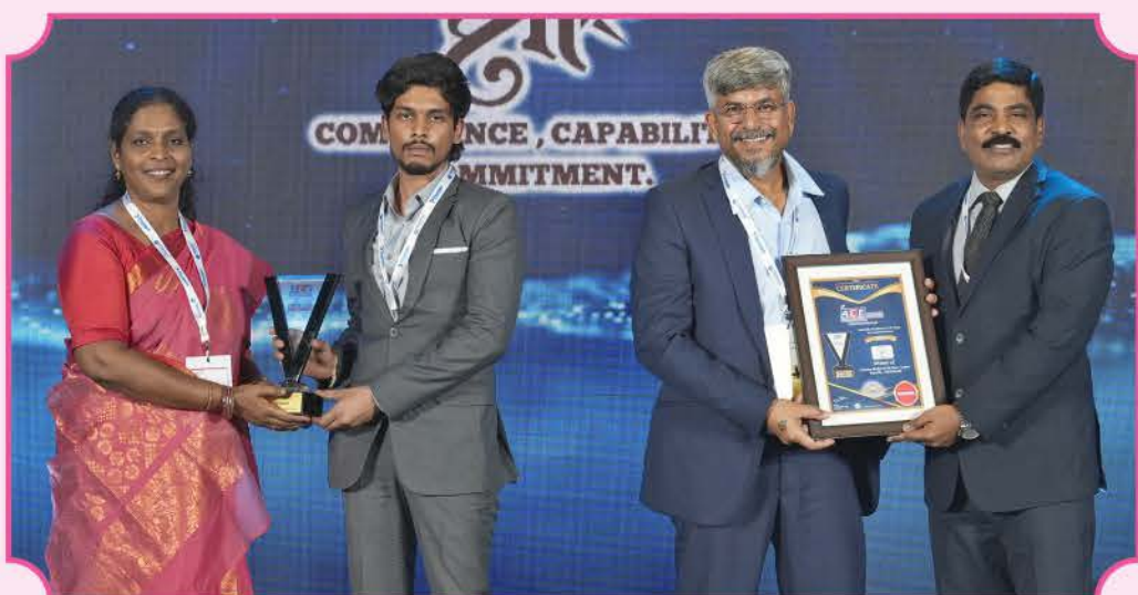
Shreepa Logistics Private Limited (IN EXPORT SEGMENT)