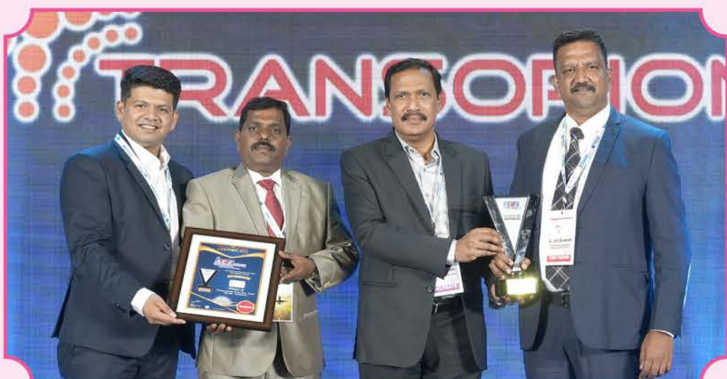
Transorion Logistics Services Pvt. Ltd. (IN EXPORT SEGMENT)