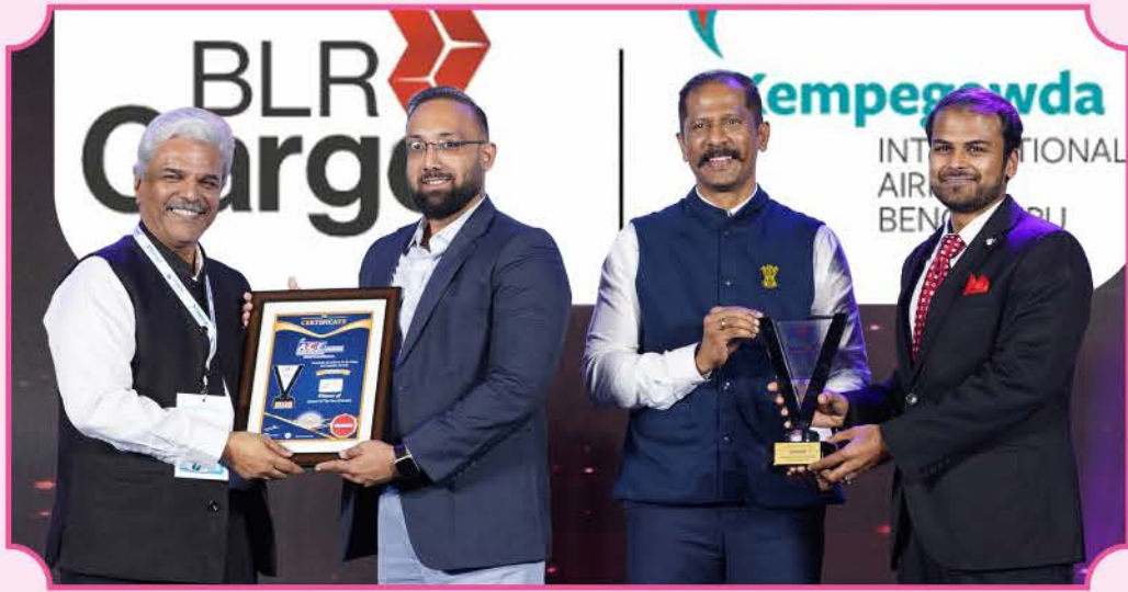
Kempegowda International Airport Bengaluru