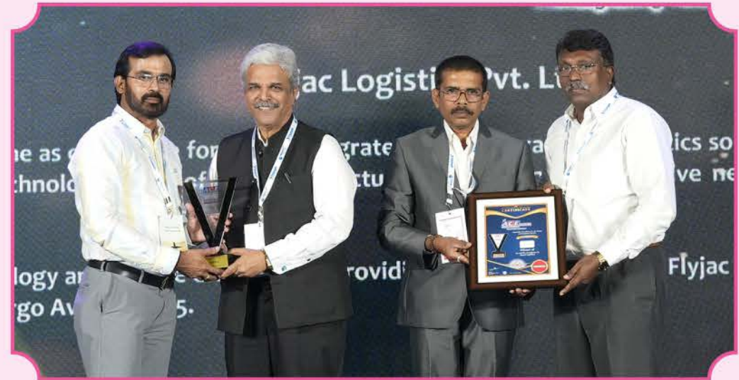
Flyjac Logistics Pvt. Ltd.