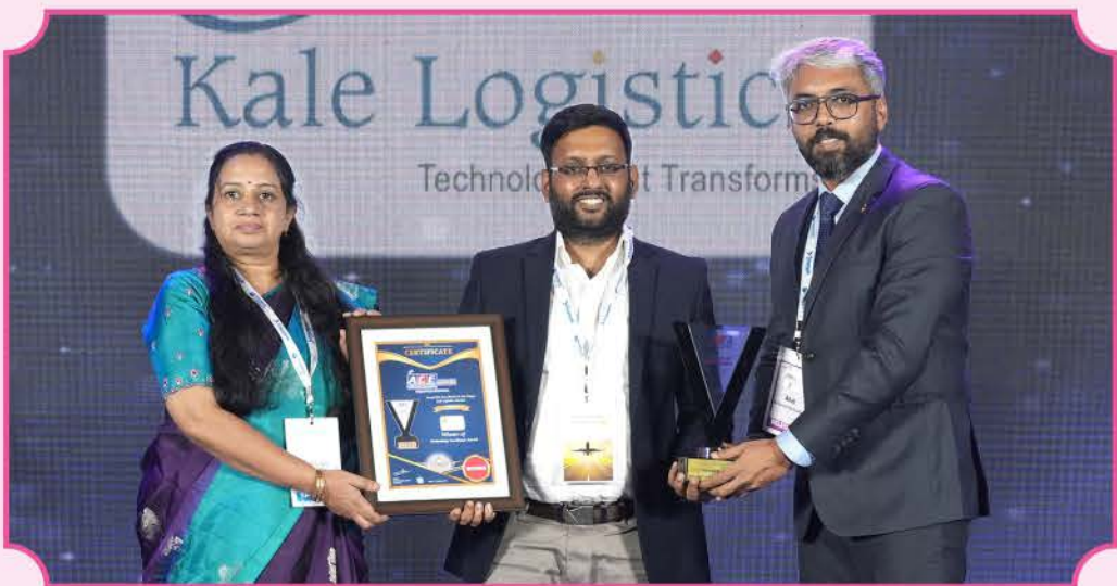
Kale Logistics Solutions Pvt. Ltd.