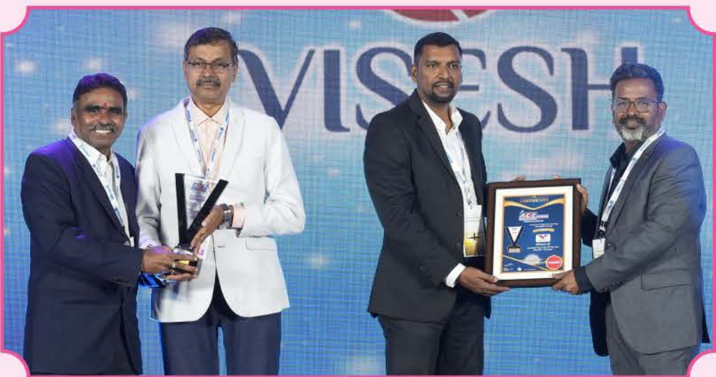
Visesh Cargo Private Limited