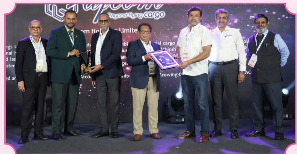
Afcom Holdings Limited