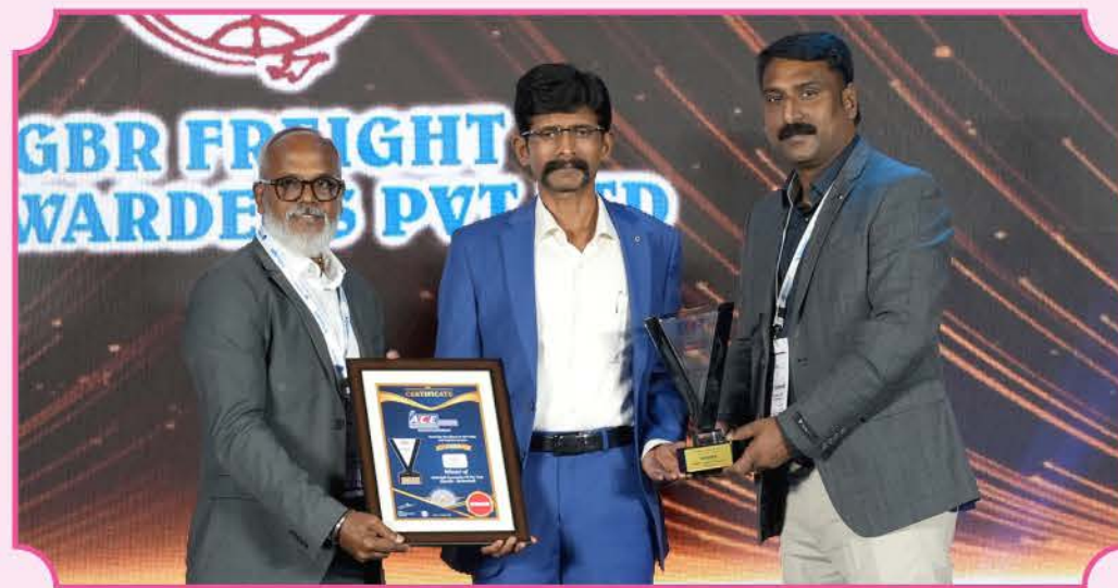
GBR Freight Forwarders Pvt Ltd